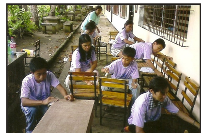
BELIEVE scholars doing a service project at their school