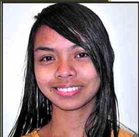
The 2 College Students