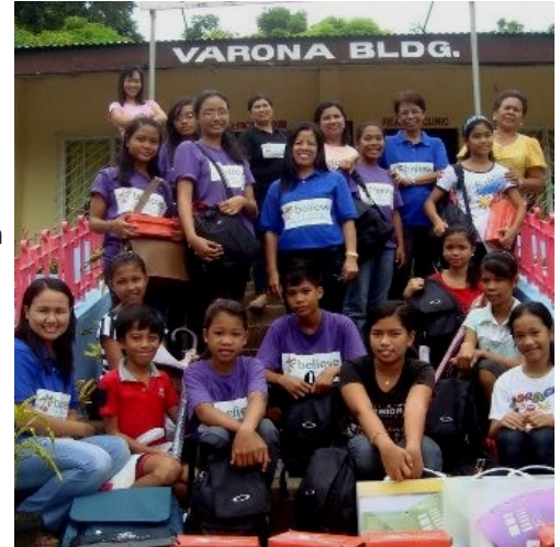
Principal, teachers and sponsored students at Sebaste High School

Another partnership is highlighted on the BELIEVE website in two short videos featuring the principal and teachers at the Makato, Aklan, Philippines High School ( http://www.believeinternational.org/aboutus.html ).